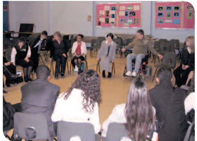
Students taking part in a drama workshop at the Salisbury School Year 10 Conference

Contact Enfield EBP for more details about our Work Experience support programme and other workshops.