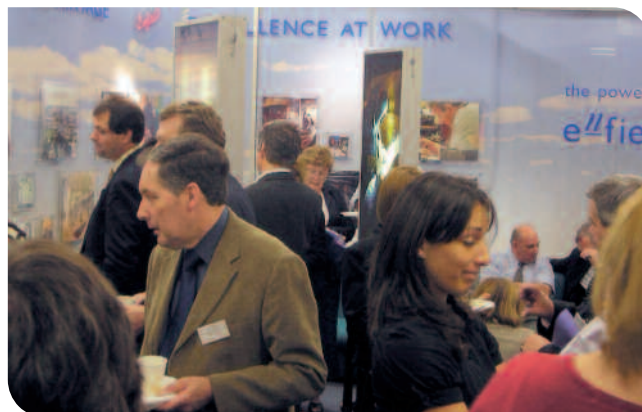
Some of our 'witnesses' networking before being interviewed by the Assessors.

In addition to highlighting the quality of the EBP's Work Experience and other Work Related Learning programmes, the Assessors commented on how impressed they were by the dedication of the staff and by the way in which partner organisations valued the work of the EBP in helping prepare young people in Enfield for the world of work.